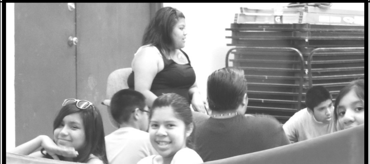
Students hiding the peone's under a blanket