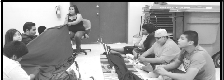
More students playing the traditional peon game