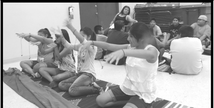
Students all showing their peone's as the other team made the calls